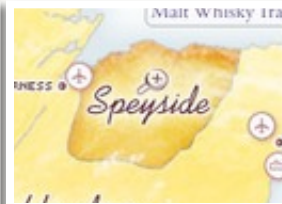
Tour Glenglassaugh & The Balvenie