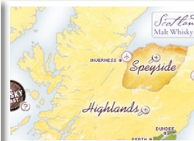
Tour Talisker & Glenmorangie