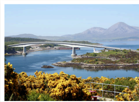
Over the bridge to Skye

We ferry back to the mainland on the morning of the 16th and head north to the Isle of Skye, home of the majestic Talisker distillery. After a VIP tour of the distillery and a night enjoying the island's hospitality we head east to Tain and the Glenmorangie distillery on the 17th. We'll spend the night in Tain before heading to Portsoy the following morning to visit recently reopened Glenglassaugh.