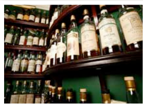
A whisky library at Craigellachie Hotel

After spending the morning in Portsoy we'll head down to Dufftown which will serve as our base while we explore the Balvenie distillery, the 250 bottle whisky bar at the Highlander Inn , and the 650 bottle whisky bar at the 5-star Craigellachie Hotel . On the afternoon of the 19th we'll head back down the road for Shabbat service and whisky tasting at Glasgow Reform Synagogue.