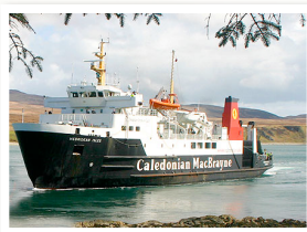
Taking the ferry to Arran & Islay

After enjoying a Shabbat service and trip to Bon Accord on the evening of the 12th we set off bright and early for the Isle of Arran on the 13th. After a VIP tour of the Arran distillery (including a warehouse tasting) we leave for Islay early on the 14th. Two days on Islay will allow us to tour and taste at Ardbeg, Bowmore, Lagavulin, and Laphroaig (plenty of surprises lie ahead on Islay).